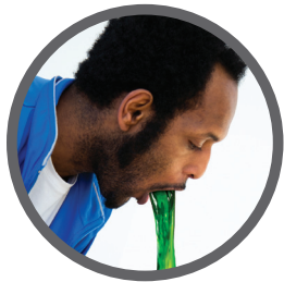
nausea or vomiting lallabo ama matag