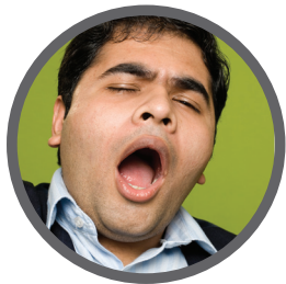
feeling tired daal dareemid