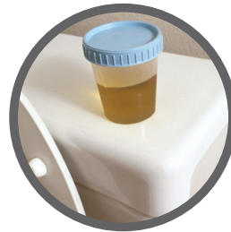
dark urine kaadi madaw