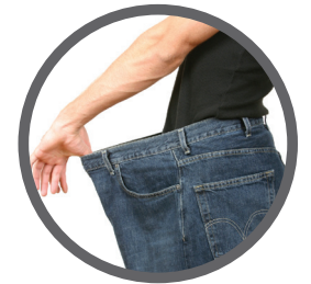
weight loss caatoobid