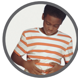
stomach pain Calool xanuun