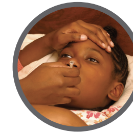
fever lasting more than 3 days qandho wax ka badan saddex maalmo