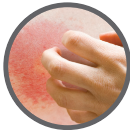
rash or itching furuuruc ama cuncun